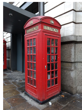
A phone booth in Bugscuffle, Tennessee bought by the MG administration for the school

As for now, the current phone policy still stands, despite the protest of many disgruntled students and teachers. However, a positive conclusion to the matter seems unlikely, as the “phone problem” rages on at MG and questions remain unanswered. Will students be able to keep their phones? Will the administration actually put phone booths in? Unfortunately and surprisingly, even The Eggplant staff does not know the answer. ♦