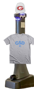
Introducing Mount Greylock's new attendance bot, MOUNTIE - Photo