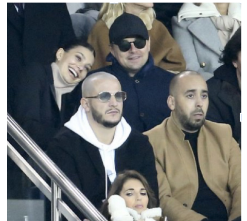
Morrone and Dicaprio sporting smiles at Yo Gabba Gabba on Ice

What other accomplishments will this #powercouple unfold? It seems, they have a lot in store for them, but only time will tell. ♦