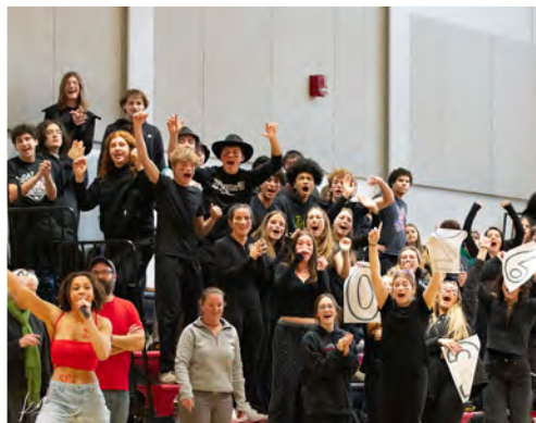
Students celebrate the calendar change.

students' happiness. Without any school to go to or any work to do, studies have shown that kids' mental health deteriorates. Many children around the globe end up miserable over the long summer break. According to The New York Times, during summer vacation kids frequently