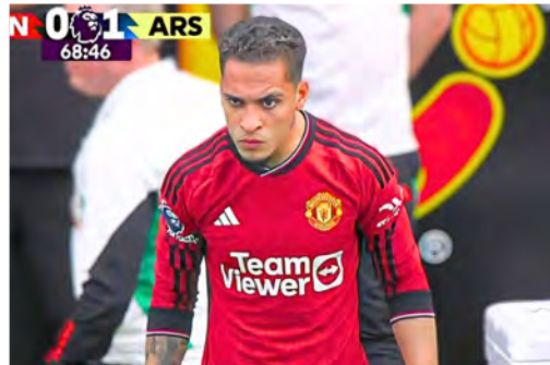
Antony about to drop another generational performance.

We all know that to be the best, you have to beat the best, and Antony definitely kept this mindset close to heart when joining Betis in the January transfer window. He knows Real