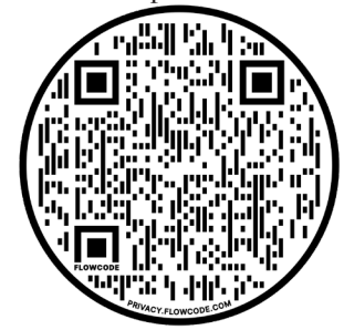
Scan here to check out the Eggplant website!

You will be unlikely to hear from this writer again. She will be leaving on an extended vacation to an unknown location that lacks WiFi as soon as this article is printed. ◆