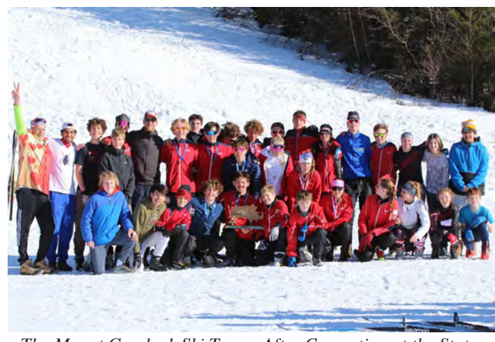
The Mount Greylock Ski Teams After Competing at the State Championship Race